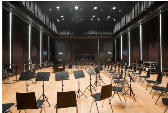
Photo 3 and 4. National Music Forum (NFM) – cameral concert halls.