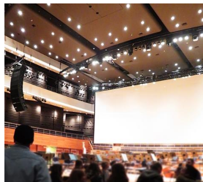
Photo 5, 6 and 7. National Music Forum (NFM) – visiting public spaces and cameral concert hall, lecture and discussion in the main hall.