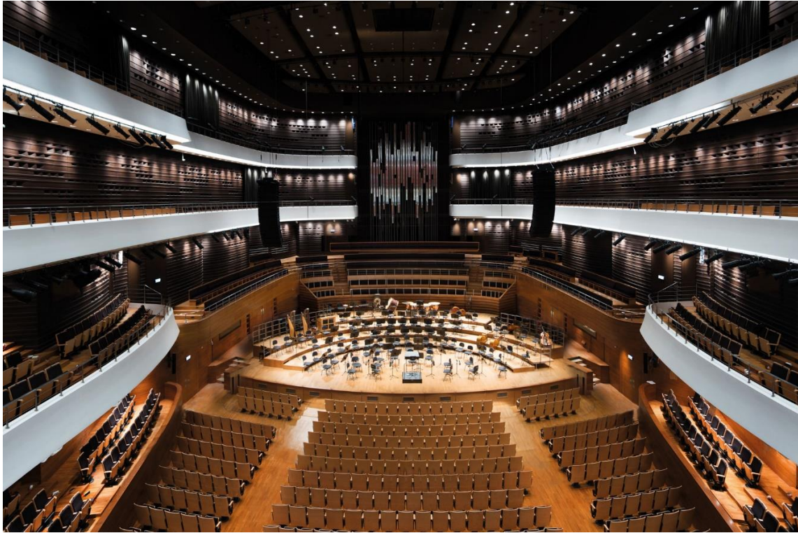
Photo 2. National Music Forum (NFM) – main concert hall [photo Łukasz Rajchert].